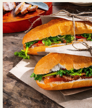
Banh Mi Sandwiches

Learn Viet: Thank you. — Cảm ơn (com-ong)